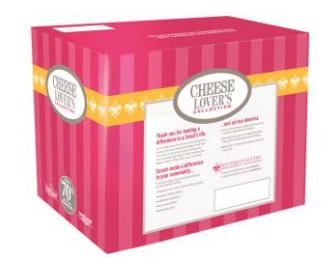
Prepared. For Life.®