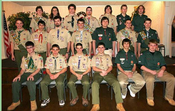
Class of 2007

The Boy Scouts accomplishes this purpose by making its program available in partnership with existing groups having compatible goals, including religious, educational, civic, fraternal, business, labor, and governmental bodies.