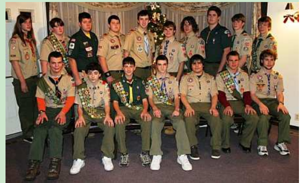
Class of 2008